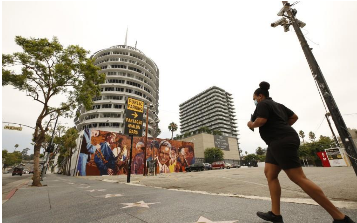
A parking lot on Vine Street next to the Capitol Records Tower is the proposed site for the Hollywood Center project.

Aarons said the Hollywood Center project site “has been the subject of the most extensive geotechnical testing of any property in Hollywood. From 2012 to 2019, seven fault investigations were performed. In each and every case, those studies have come to the conclusion that there is no active fault on the project site.”